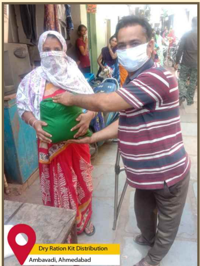
Dry Ration Kit Distribution

HDRC collaborated with Community level collectives and local leaders to make a quick assessment of support required in their project intervention areas. They came out with